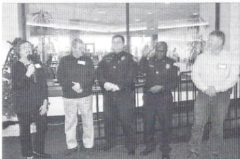
Members of the Palmetto Patriots accept the Certificate expressing appreciation for their continued support.