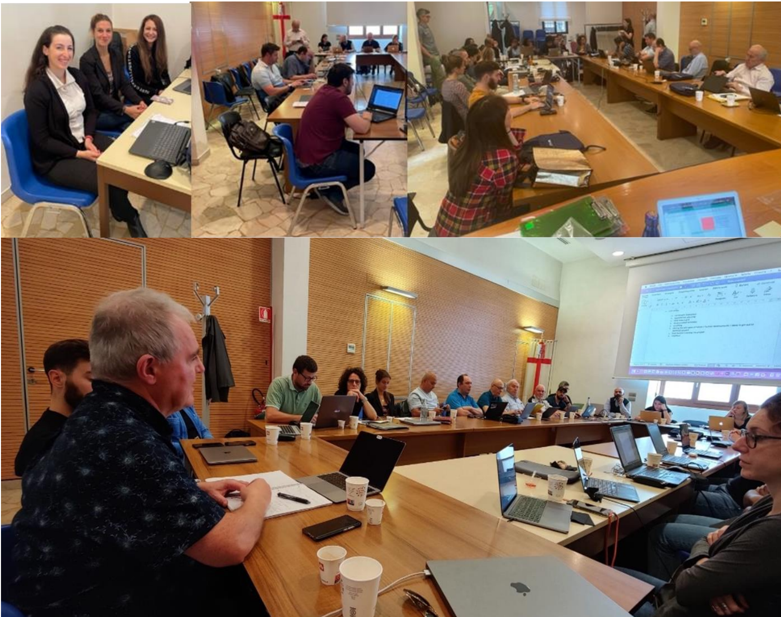
The Ethics team assessing the data gathered from the Ethics survey prepared for the guests in Padova (top left), while the rest of the IMPETUS team discuss the events of the Live Exercise (middle, right and bottom).

The following day, IMPETUS members gathered to discuss the live exercise, one-on-one demonstrations, attendee feedback, and ways to improve the use of the IMPETUS solution for the future.