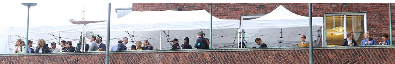
Observers on the balcony

A comprehensive IMPETUS scenario was prepared and implemented at Oslo City Hall on the 18th of August for the first live exercise of the IMPETUS platform and tools. After careful planning and preparation, all the IMPETUS tools supporting the processes of the city's Security Operations Centre (SOC) were brought into one place. There were about 30 project participants, five COSSEC members and about 60 external guests (from various actors in Oslo responsible for emergency response, representatives from other cities in Norway and representatives from other related projects in Norway and internationally). The scenario included testing of the individual roles and functions of the IMPETUS platform and integrated tools.