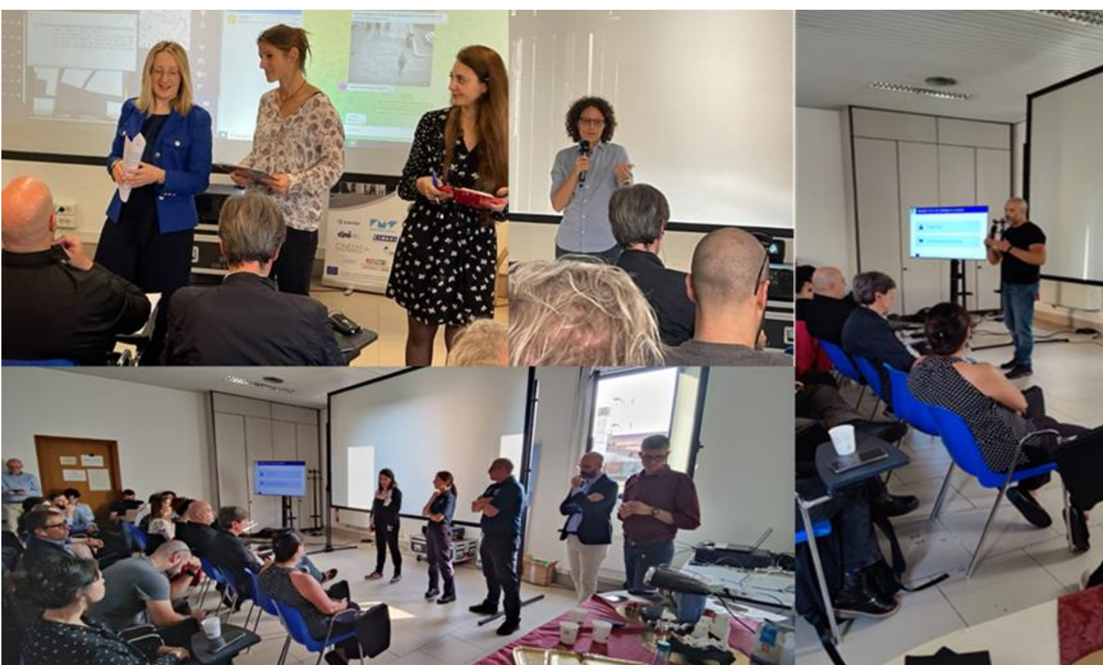
The feedback from local police and by the SOC operators was gathered by IMPETUS members.

Valuable feedback from the SOC operators was gathered about how they experienced practical use of IMPETUS, and its potential usefulness for their city. COSSEC members also gave valuable feedback. All of this will be an important input to the structured validation activities that will now be carried out by the project team. This will influence the strategies being developed in the consortium for the longer-term development and promotion of project results.