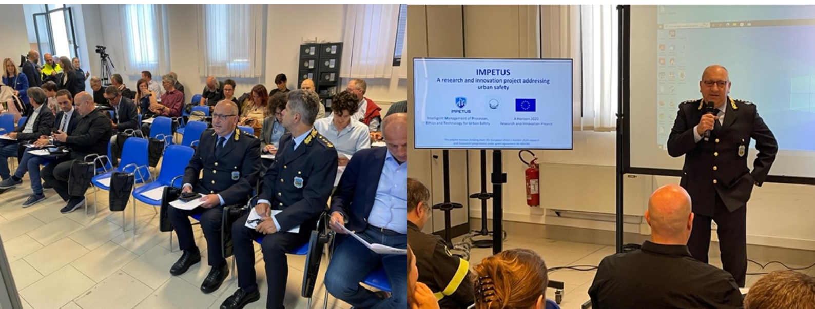
Councillors and Representatives of Padova and other Municipalities, Officers of all the police forces and other first responders.

The guests arrived in eager anticipation of what they were about to see, learn and experience from the live exercise. Among the guests were councillors and representatives of Padova and other municipalities, officers of all the police forces and other first responders (firefighters, civil protection, etc.), as well as our COSSEC members. Moreover, since the Live Exercise has been planned as part of the evaluation process, there were operatives from different first responders (Local Police, National Police, Carabinieri, Firefighters).