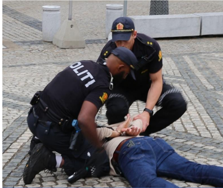
The 'gunman' being arrested

The exercise was followed by a de-brief session where all participants were invited to provide feedback on the IMPETUS solution and make suggestions for how it could be improved. They also provided feedback on the live exercise itself and proposed ideas for how to plan the next live exercise in Padova.