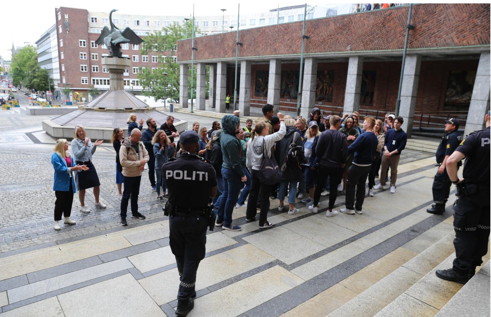
Demonstrators outside the Oslo City Hall

Live exercises are essential to the development and evaluation of the IMPETUS technologies and approach. The hands-on experience of safety practitioners in live exercises in the pilot cities of Oslo and Padova helps us to assess what works well and what needs to be improved, and to learn how technologies can be effectively integrated in working processes.