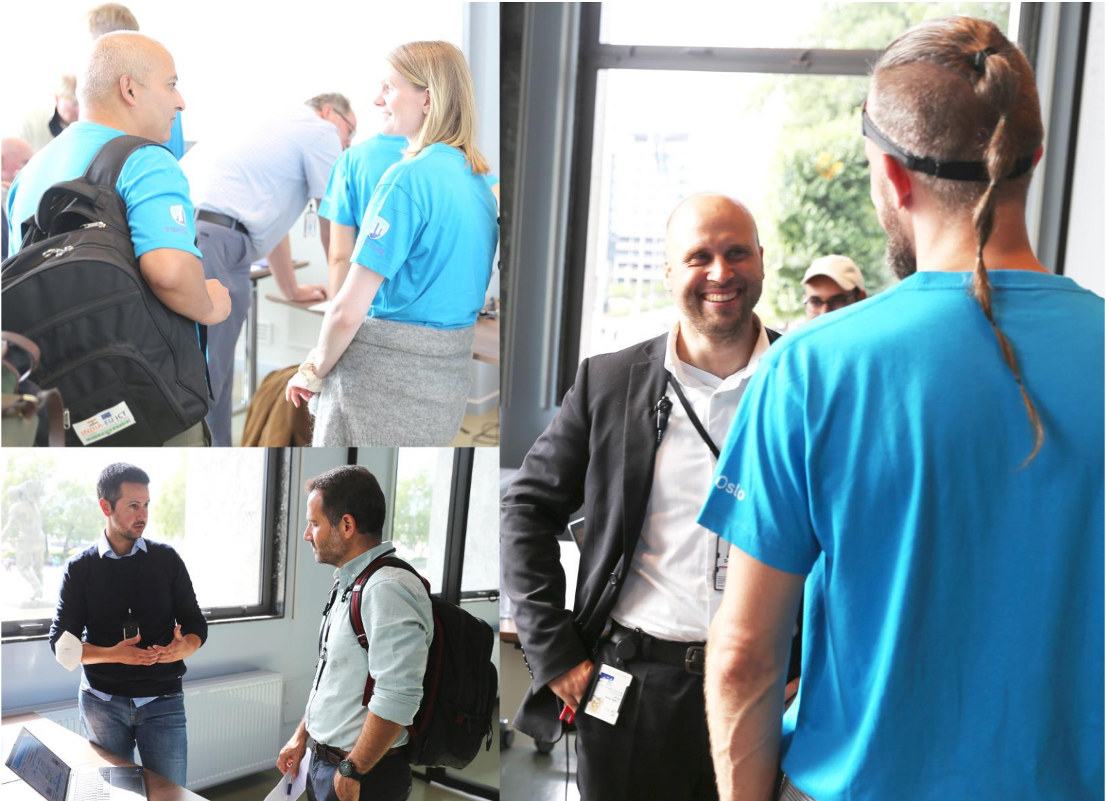
The poster/demo session

The day ended with an informal poster/demo session that provided detailed demonstrations of the tools and Practitioners Guides. External guests could move freely between the “stations”, and there were many fruitful one-on-one dialogues between external guests and project members.