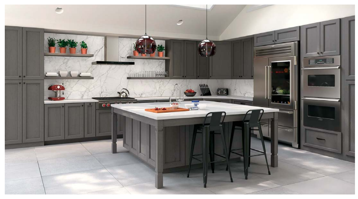
Nova Light Grey Shaker AN _{\text{Stocked in NJ}}