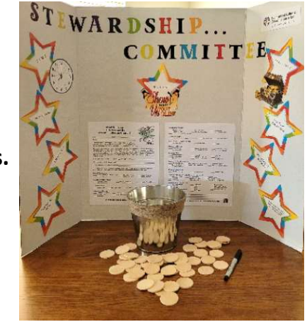
Time & Talent Bucket Toss

about. Step 3: Toss one token into each of the buckets of your choosing. If you don't have a mailbox, or run out of tokens, you'll find a bowl full of blank tokens you can put your name on. If you are unable to get to church, no worries! Time & Talent sheets will also be available via mail, email or personal delivery so everyone is able to participate. Toss your tokens on Sundays, or on a weekday during regular church office hours. In-Gathering Sunday, November 7 <sup>th</sup>, is when we bring our completed 2022 Financial Pledge Cards , give thanks for YOU – our Fabulous Family of Faith, and receive a special little something to help our lights shine within and beyond our doors.