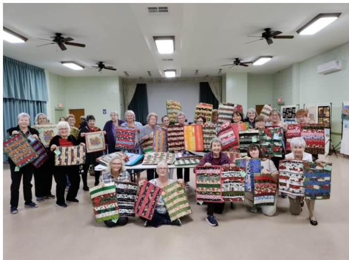
Placemats that were donated to Meals-on-Wheels, with some of the guild members who sewed them.