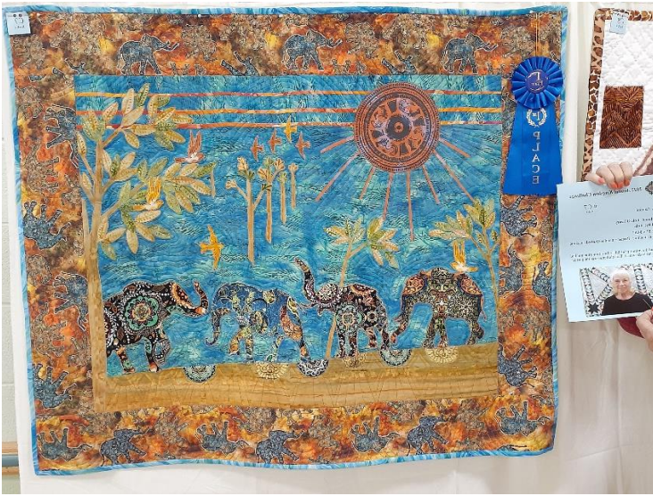
1 st Place-Lola O'Leary