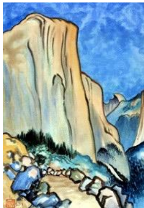
(Chiura Obata “El Capitan”, 1931)

“My grandparents, teachers and backpacking friends taught me that it’s about making it through, taking things slowly, being consistent and saving your energy. I still knit, sew, read books, and make drawings even though I live outside. My friends appreciate my artwork. It helps them remember things they’ve done. Chiura Obata’s images of Yellowstone and the Sierras are very inspiring. We live in such a beautiful place.”