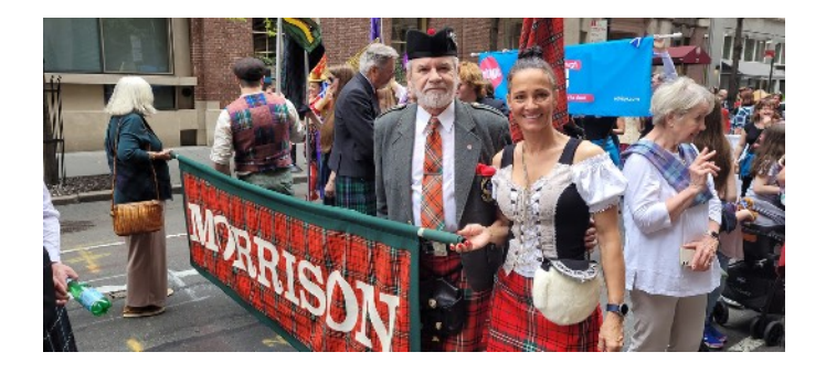
Grandfather Mountain Gathering/Games