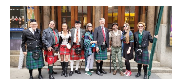
Stone Mountain Gathering/Games