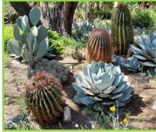
BTA's Demonstration Garden

Boyce Thompson Arboretum celebrates its 100 th anniversary this year.