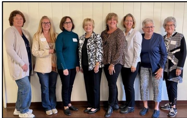
Above, Presidents of Garden Clubs in the Central and Eastern Districts; Below, SGC Members in attendance at the District Meeting