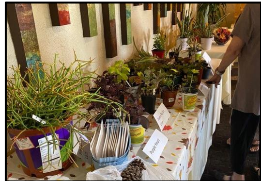
Members' donated plants for sale during the meeting.