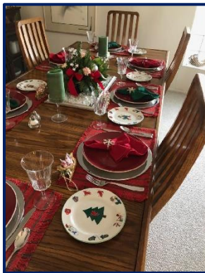
Helen Griller's Welcoming Table