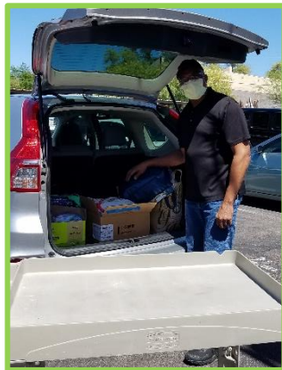
Volunteer unloading donations.

The bags are delivered to the VA Community Resource and Referral Center in Phoenix. From there they are distributed to the homeless vets living on the streets in our local area.