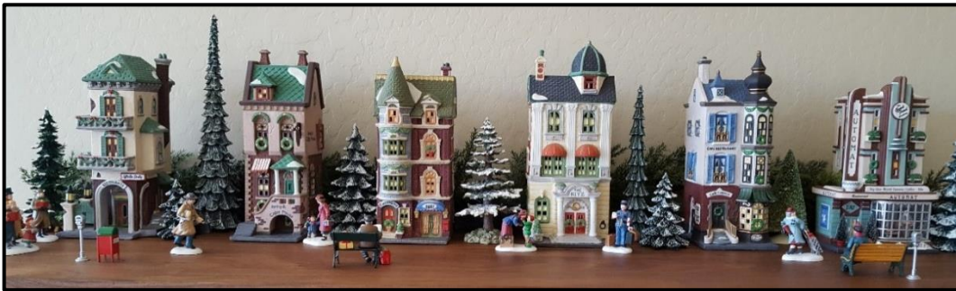
Some of Sherry Baer's "Christmas in the City" collection