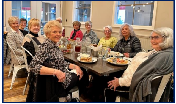
January 24 th Arizona Flower Show Judges Council “Taking The Mystery Out of Design”