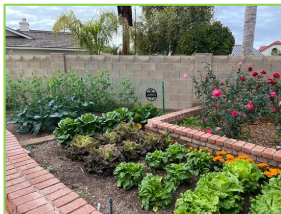
Jamie's Winter Garden