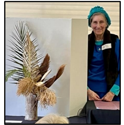
Wanda Collins Featured Plant Material