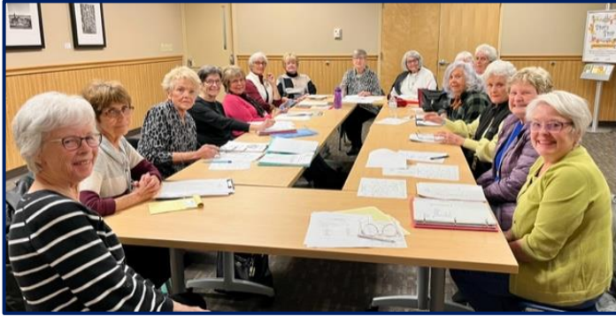
The Flower Show Committee – Meeting at the Mustang Library on January 23 rd