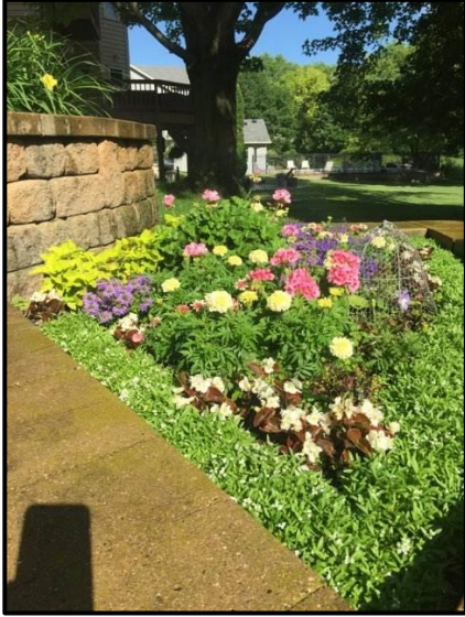
A colorful garden bed