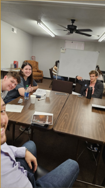
-Sunday Morning Bible Study testing out my new phone

Whether you like the fall or don't like the fall, there is no denying this is, most definitely, the most exciting time of the year for our church! It is exciting because we are incredibly busy doing ministry for our community. October was an absolute blast in the 412 student ministry. As for Wednesday night AXIS, we finished up our series on the lives and legacies of the prophets Elijah and Elisha. Let me tell you, I have enjoyed teaching on these men so much. I have learned a lot just from teaching this series and my prayer is that the teenagers did as well. I remember when I was a teenager in the youth group and how I still don't remember probably 90% of the lessons my youth pastor preached. But there are many things I do remember and it's those things that have stuck with me my whole life and I carry into my adulthood today. That is all I can hope for with these teenagers, that God is working in them to latch onto at least one thing from each lesson or series we do that will help them grow closer to Him. We have now started a new series we are calling True and Better. In these 5 weeks we are looking at different characters in the Bible that serve as "types" of Jesus. Meaning their lives and legacies point towards Christ and his ultimate fulfillment of what they tried to do.