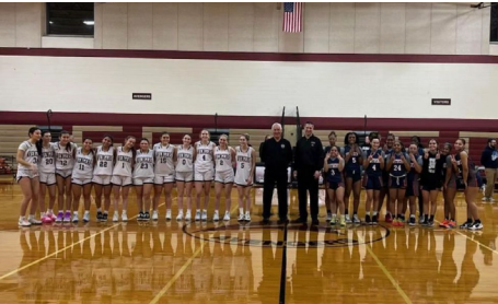
East Greenwich and Shea/Tolman girls basketball teams

All and all, the team has persevered through this year and has had a tremendous amount of fun playing basketball, having pasta dinners, doing team bonding, and sharing these memories as a team. Congratulations to the Seniors and congratulations for a hard fought season.