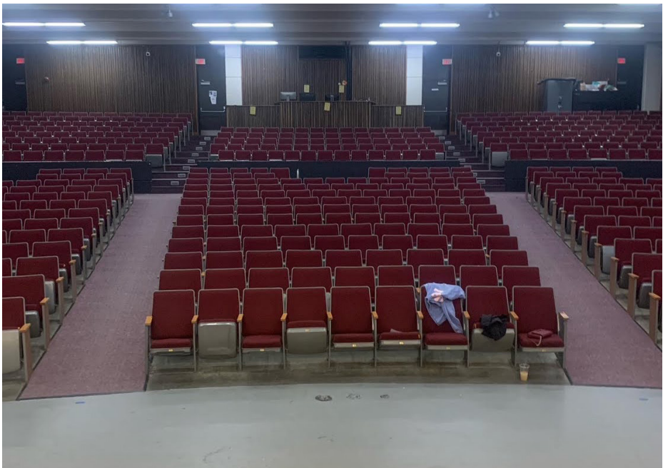
The current EGHS auditorium, slated to be renovated using the money from the school bond.

At EGHS, there are plans to renovate and improve most areas of the school, including but not limited to, “additional classrooms, renovations of the basement and locker rooms, renovation of the life skills suite, upgrades to