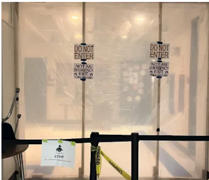
The lower south west corner of the school earlier this year due to renovations to resolve recent issues.

Upon further investigation, it was determined that the previous power outage caused