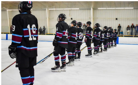
East Greenwich and Toll Gate’s merged hockey team, the Avenger Titans

Before the season started, the team found out that they were merging with Toll Gate High School, since Toll Gate split from the Co-Op they had with Pilgrim. The East Greenwich Avengers became the East Greenwich Toll