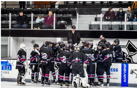
The Avenger Titans during game against Cumberland High School