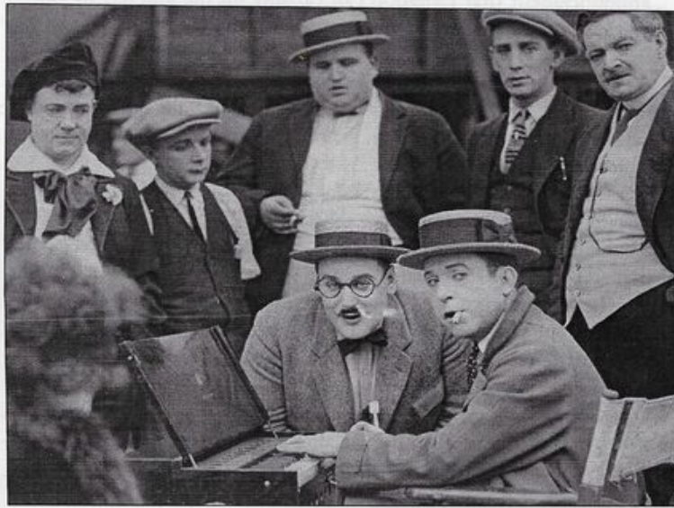
A candid shot of Harry Langdon and Vernon Dent on the set of The Hollywood Kid (Sennett, 1924).

NITWITS. In those 20 years, they made numerous films together. (photos from STOOGE HEAVY & KING OF SILENT COMEDY)