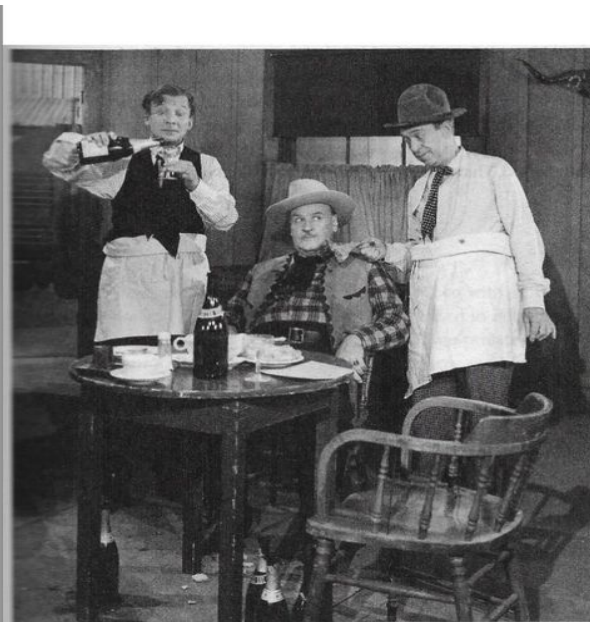
Harry's last role in Pistol Packin' Nitwits , with El Brendel and Vernon Dent.

Vernon and Harry met up again in 1924 at Mack Sennett's studio. Vern appeared in Harry's very first Sennett film in 1924 PICKING PEACHES , and also his last film in 1944 PISTOL PACKIN' NITWITS . Though Vernon's scenes were shot, they were edited from the final cut of