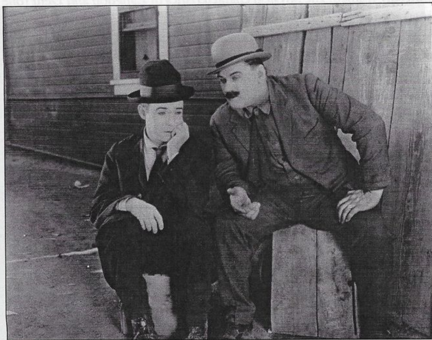
Harry Langdon and Vernon Dent in Plain Clothes (Sennett, 1925). This was taken two years before Stan Laurel and Oliver Hardy became a team.