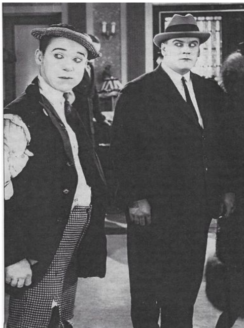
A youthful Vernon Dent gives Harry Langdon "The Look" in their very first screen appearance together. Picking Peaches (Sennett, 1924).

Harry and Vernon may have crossed paths as early as 1913 when Harry was in vaudeville. Vern was 18, Harry was 29. (Hayde & Harter, LITTLE ELF Pg. 51)