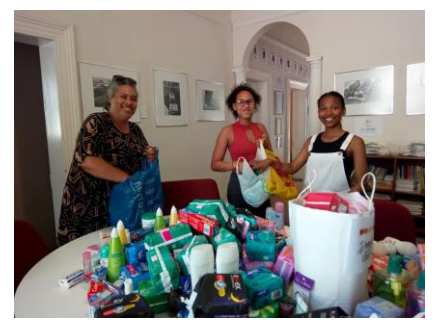
Dignity 4 Girls – Xmas Giving – This donation drive starts in November until mid-December when we have out the DIGNITY GIFT BAGS to our beneficiaries for the holidays. Individuals, companies, supported, families, board members and staff donate. We thank them all.