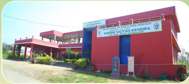
EGVF-KRISHI VIGYAN KENDRA ADMINISTRATIVE BUILDING