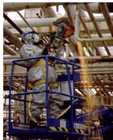
Figure 3-6. Example of Level C PPE.