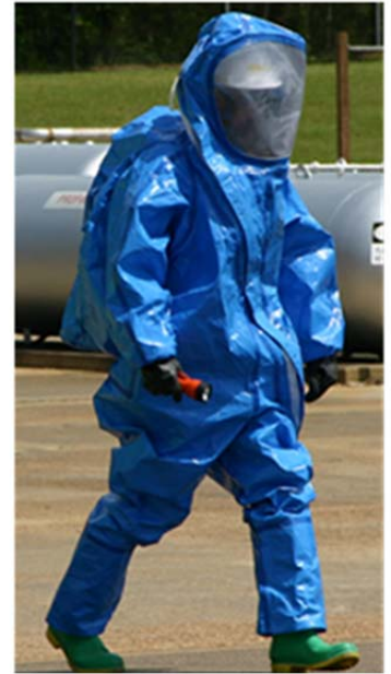
Figure 3-3. Example of Level A PPE.

Level A protection is defined as a specialized chemical protective clothing which, when used in conjunction with air supplied respiratory protection devices, offers a sealed, integral level of full body protection from a hostile environment.