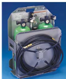
Figure B-2. Example of Grade D respirable compressed air.

Air is supplied to the respirator wearer through an air hose not to exceed 300 feet in length (or less, depending upon the specific NIOSH approval (12.6.4)) in a continuous flow with a demand or pressure demand regulator.