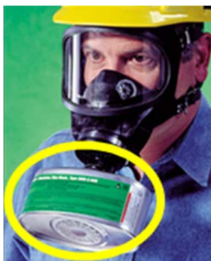
Figure B-4. Example of Cartridge in Air Purifying Respirator.

An increasing concentration of contaminants in the air or an increase in the breathing rate will decrease the available service life of a respirator cartridge or filter. Day-to-day changes in job operation, the level of physical work, or the level and mixture of contaminants in the air affect the service life. The recommendations provided by the manufacturer of the respirator should be followed.