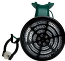
Figure 3-1. Example of an escape respirator – nose clip and mouth piece.