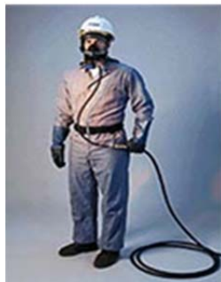
Figure B-1. Example of air supply respirator.

Air supply respirators are supplied with respirable compressed air. Sometimes these are referred to as airline respirators. The source of air is typically either large stationary compressed breathing air cylinders or compressed air from a plant air system that meets the requirements for respirable air. The Compressed Gas Association states that Quality Verification Level D is the minimum requirement for such air (12.7.1).