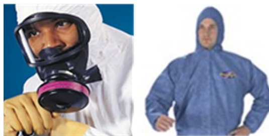
Figure 3-2. Example of hoods intended to protect the top of the head and neck.

Several of the tasks discussed in this pamphlet include PPE recommendations for protection of the head. For some tasks discussed, PPE recommendations include chemical protection of the head and neck. As discussed in this pamphlet, protection of the head includes the top of the head, but not the front or the back. Face and eye protection are needed to protect the front of the head. A hood or comparable PPE is needed to protect the back of the head and neck. A hood can also serve to protect the top of the head. A hood with an integral face mask serves to also protect the face and eyes. A hard hat typically used to protect the top of the head from impact can provide chemical protection for the top of the head if of suitable design. A suitably designed hat in combination with a face shield and chemical splash goggles can serve to protect the head, face and eyes.