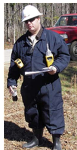
Figure 3-7. Example of Level D PPE.