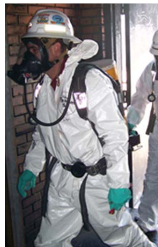
Figure 3-5. Example of Level B PPE.

Level D protection does not require specific respiratory or skin protection