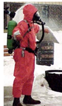
Fig. 3-4. Example of Enhanced Level B PPE.

Enhanced Level B protection provides fully encapsulated protective equipment, but is not gas tight. This involves atmospheres with IDLH concentrations of specific substances that present severe inhalation hazards and that do not represent a severe skin hazard; or that do not meet the criteria for use of air-purifying respirators.