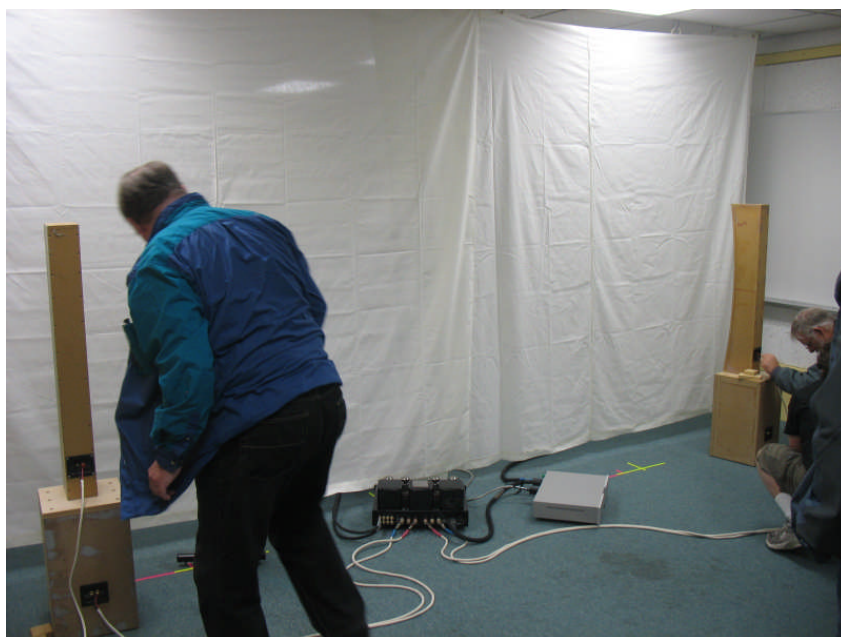
Speakers to be judged "blind" behind the curtain.