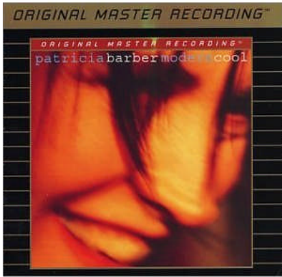
Patricia Barber SACD Modern Cool