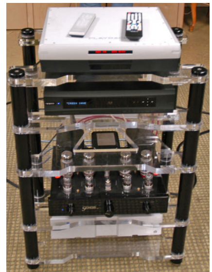
Playback Design DAC (top shelf) used to playback DSD files.

tion, Bruce can explain and demonstrate how the recordings can be improved by reducing noise, etc.