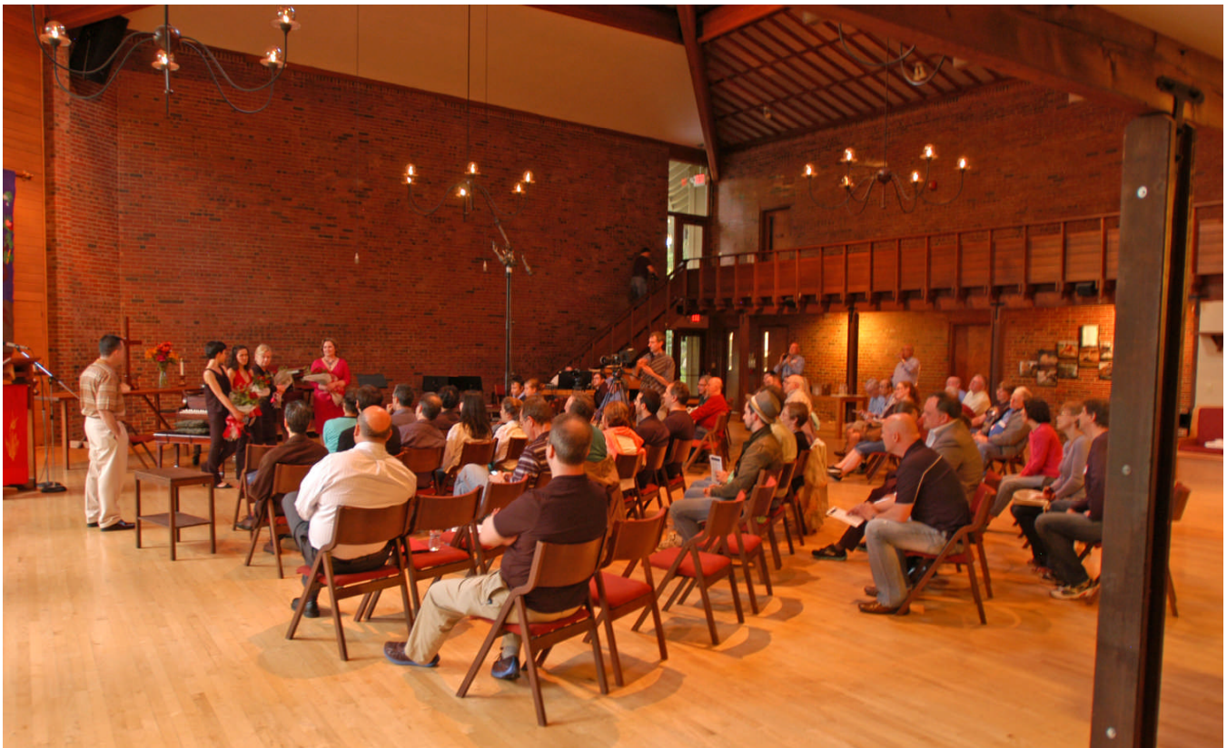
Attendees filled the church sanctuary. Note the location of the microphone array.

Then we had a break down in our meeting room with food prepared by Jay Hope. This was a really nice spread, raising the bar again for future events. During the break Bruce prepared the recordings for playback on the club system