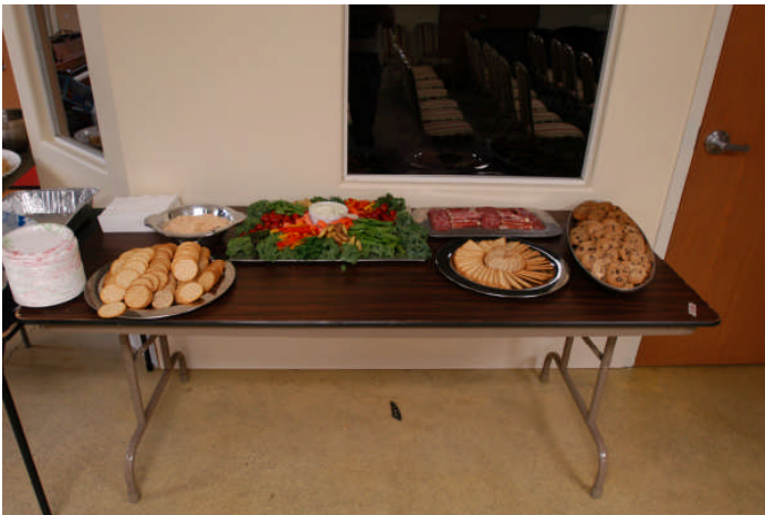
During the break prior to the “Recorded” session everyone feasted on food prepared by Jay Hope.