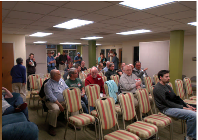
A record number of attendees getting ready for the “Recorded” session.