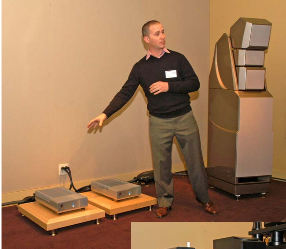
Ayre's new mono block amps and new preamp are milled from solid aluminum. Very nice.