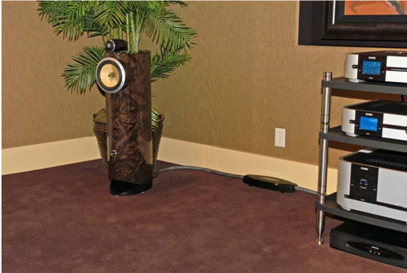
B&W demonstrated their new Signature speaker.