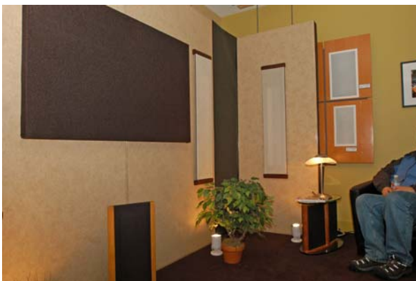
Magnapan's new wall mounted speakers and subwoofers utilize their planar magnetic dipolar panel technology.