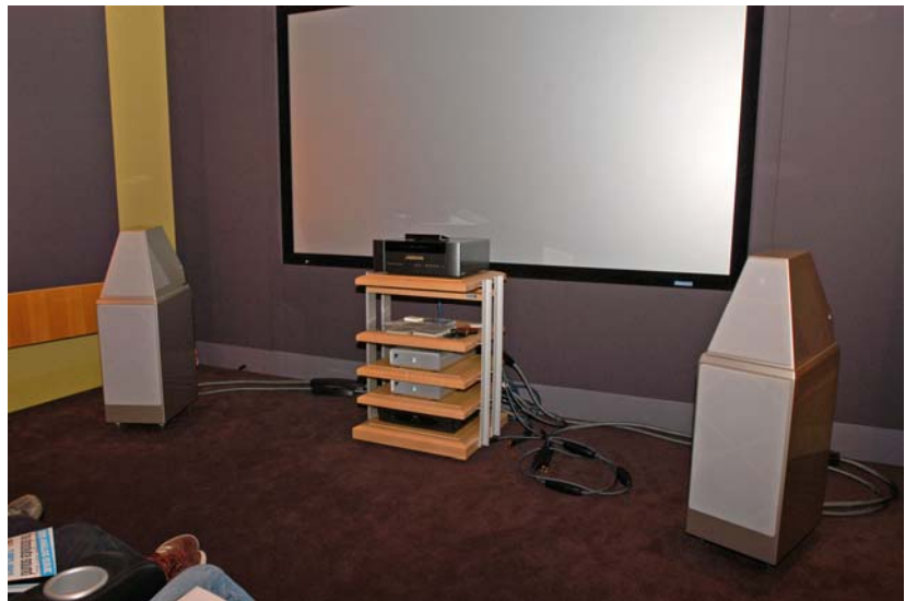
Transparent Audio demonstrated their new cables series.