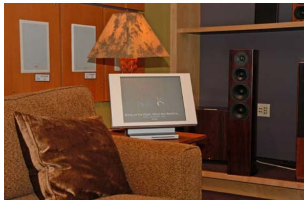
Sooloos music server system