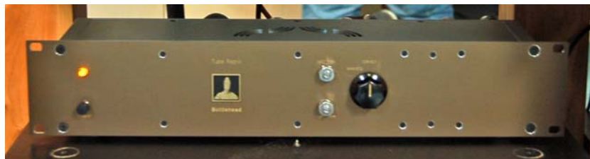
The tape heads are directly connected to an external preamp!