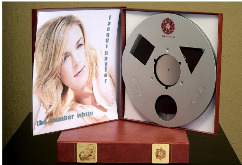
Tape 001 Jacqui Naylor

Tape in the mastering business is used as an “effect”. There are hundreds of tape emulation boxes and plug-ins for software. Some are junk, some are pretty close and some are damn good. The “effect” we use tape for is the tape head saturation that we get when levels get too high. Pretty much like the effect today with the loudness wars, when levels get too high, we get digital clipping. Tape saturation is like digital clipping, but more pleasing to the ear. Drums recorded on tape have a “fat/euphoric” sound. I use the tape effect on digital recordings that sound too harsh and have been recorded “in-the-box”. If I want to fatten up the bottom end of a recording, I might run it through a tape machine.