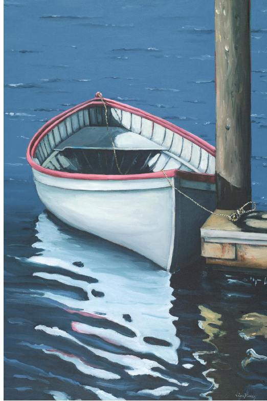
"If I Had A Boat"