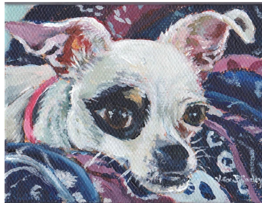
Custom Pet Portraits