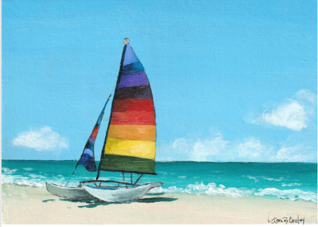
Come Sail Away