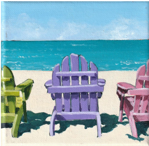
"Waiting For Friends"