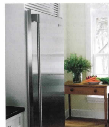
REFRIGERATOR The Electrolux Icon Energy Star refrigerator uses less power. Look for the Energy Star rating on dishwashers as well.