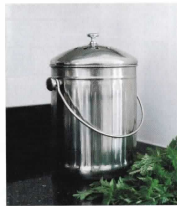
COMPOST PAIL "Our chickens, falcons, peacock, and crow are fed bits from the compost pail, and the vegetarian compost is put aside for the garden," Kennedy says.