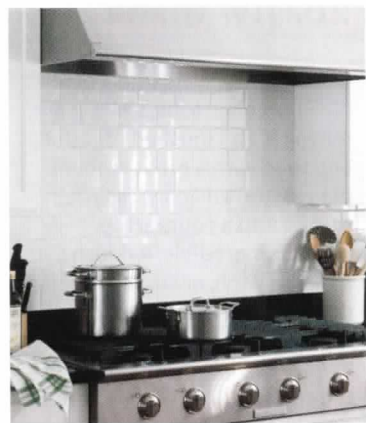
BACKSPASH Rittenhouse Square subway tiles in Arctic White are by Daltile. The company tries to minimize waste by recycling scrap tile back into the manufacturing process.