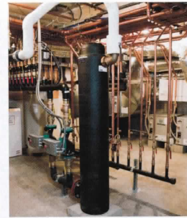
HEATING A geothermal pump supplies radiant heat to the floors and will save energy in the long run. >>