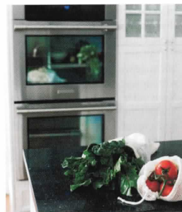
WALL OVENS The Electrolux Icon convection double wall oven has a control panel that lights up when you need it and dims when you don't.