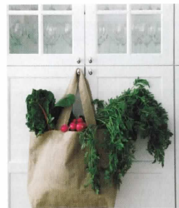
CABINETRY Petersburg Square cabinets by Holiday Kitchens are designed to use less wood in the construction process.