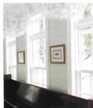
WINDOWS AND PAINT Marvin windows are double-paned and made of Low E 366 glass, for energy efficiency. Paint is Benjamin Moore's low-VOC Aura in Hancock Green.