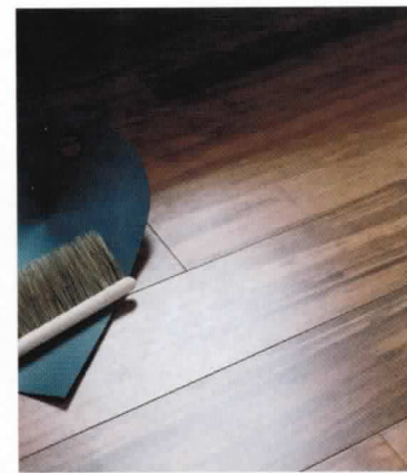
FLOORING Carbonized Strand bamboo flooring from Dragonfly Bamboo has an anti-scratch UV coating to prevent fading.