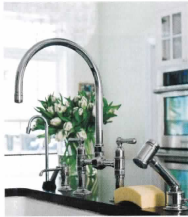
FAUCET Kohler's HiRise bridge faucet is equipped with an aerator to reduce water consumption while maintaining a steady flow.