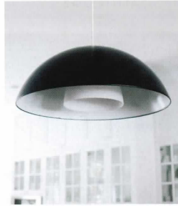
LIGHTING The 365+Brasa pendant from Ikea and the cabinets are fitted with energy-saving LED lights by Ozniium that generate less heat and last for years.