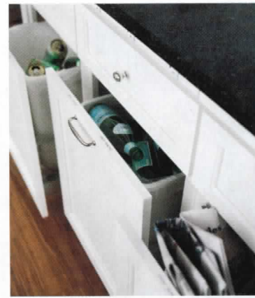
RECYCLING BINS "I'm militant about waste, and my children are very well-trained," says Kennedy, who had one end of the island fitted with six recycling bins.