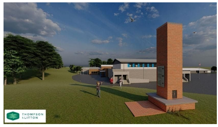
Thompson & Litton Architects, rendering of the proposed Chimney Swift Tower

To help the birds, chimney swift towers have been built around the country. We are a small group of interested Radford citizens who would like to build the McHarg Chimney Swifts a new home. We presented the idea to the Radford City School Board at the October 2020 School Board Meeting and received their resounding approval to move forward with the project. Thompson & Litton Architects of Radford have graciously designed and contributed plans for the tower. Avis Construction of Roanoke has given us a cost proposal of $13,347 and has agreed to complete the project before the birds return from South America in April. Both firms are involved and invested in the McHarg renovation. All plans and materials will blend with the new school; it will be professionally designed and built. Little to no maintenance will be needed. The McHarg Chimney Swift Tower will provide a safe nesting and roosting place for the birds for many generations to come.