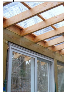
Consider the extras, such as heating and cooling, ventilation, etc.

Before signing on the bottom line, think about the extras. How will you heat it? How will you cool it? How will it be ventilated? These are important factors to consider and they need to be addressed. A greenhouse might produce wonderful