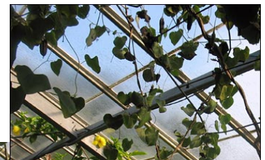
Take into account where all the extra plant life will go during the growing season.

evocative fragrances, and your very own tomatoes in January might prove delicious, but if the cost of growing them is equivalent to a trip to California to pick your own, you might want to hang on to the growing space.