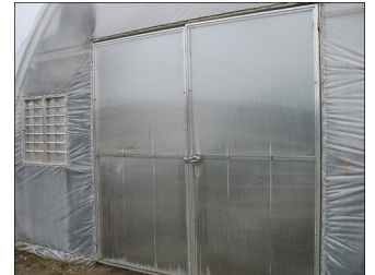
A wide doorway is key for hauling things in and out.

quality greenhouses on display at reasonable prices. The framework is usually solidly constructed of aluminum with