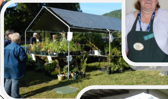
People's Choice Award Joy Story