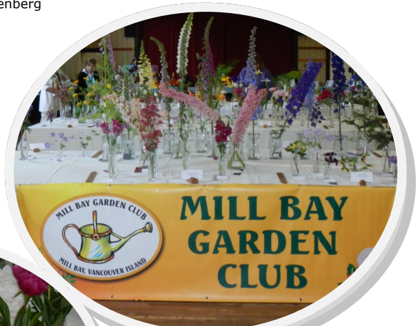
How many gardeners to raise a tent?