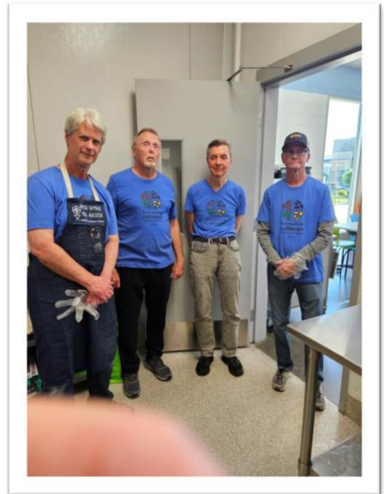
The gang at work