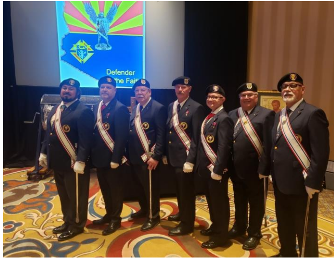
Numerous Assemblies came together to provide a Color Guard at the State Convention Banquet May 21.