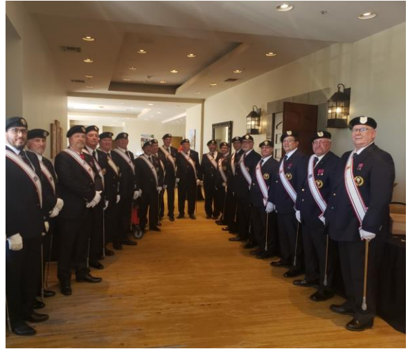
Nearly 40 Sir Knights participated in the State Convention Memorial Mass at El Conquistador resort in Tucson last month.