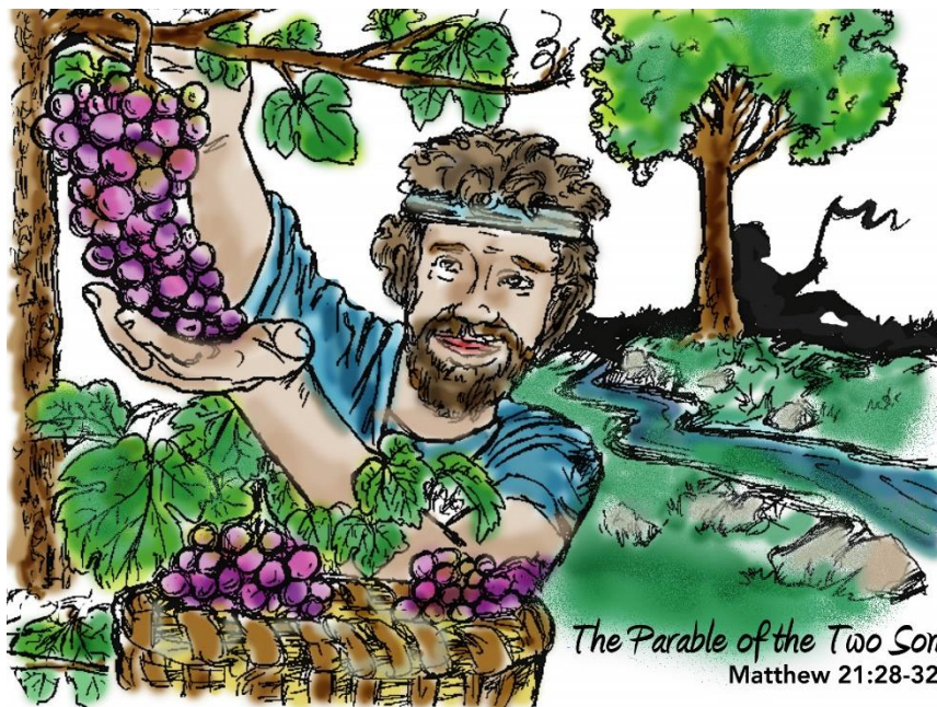
The Parable of the Two Sons Matthew 21:28-32