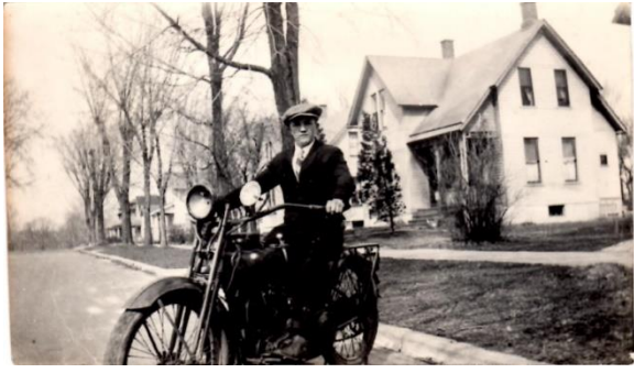
Thought the motorcycle looked pretty neat!