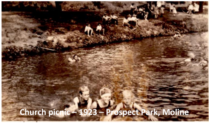
Church picnic - 1923 - Prospect Park, Moline