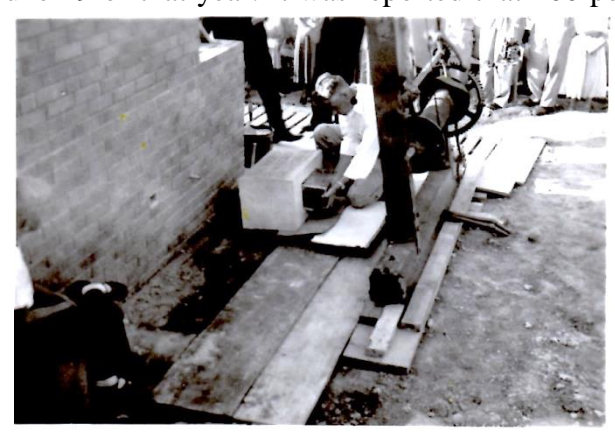
Laying of the corner stone