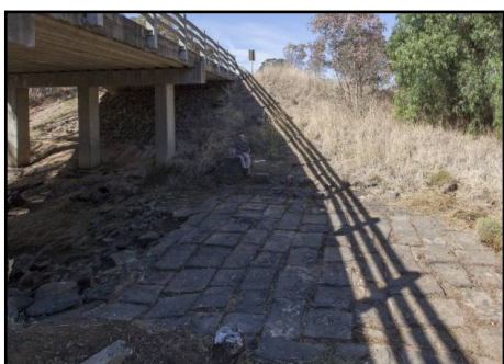
Dobie Bridge.