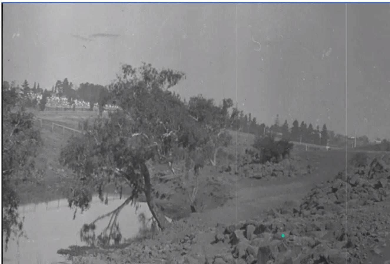
Merri Creek and Coburg Cemetery. Date unknown.