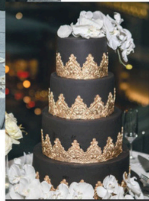
Midas Touch Channeling opulent 1920s style, the bride and