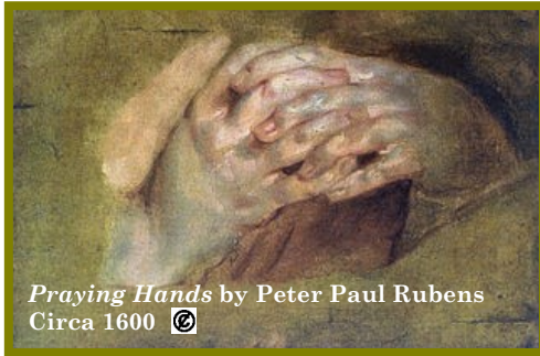
Praying Hands by Peter Paul Rubens Circa 1600

All this we ask through your Son Jesus Christ: By him, and with him, and in him, in the unity of the Holy Spirit, all honor and glory is yours, Almighty Father, now and for ever. Amen.