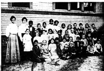
AN EARLY CLASS of reluctant looking scholars at Farmdale pose for a picture with their teachers.