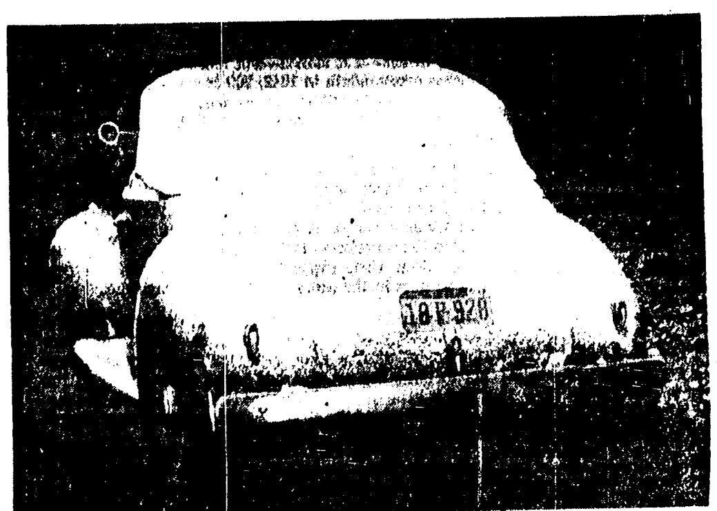
WHITE COVER-Automobile parked at Linda Vista Ave. and Lida St., near the Rose Bowl, wears a temporary dress of snow. Parkway near the car is also covered with snow.