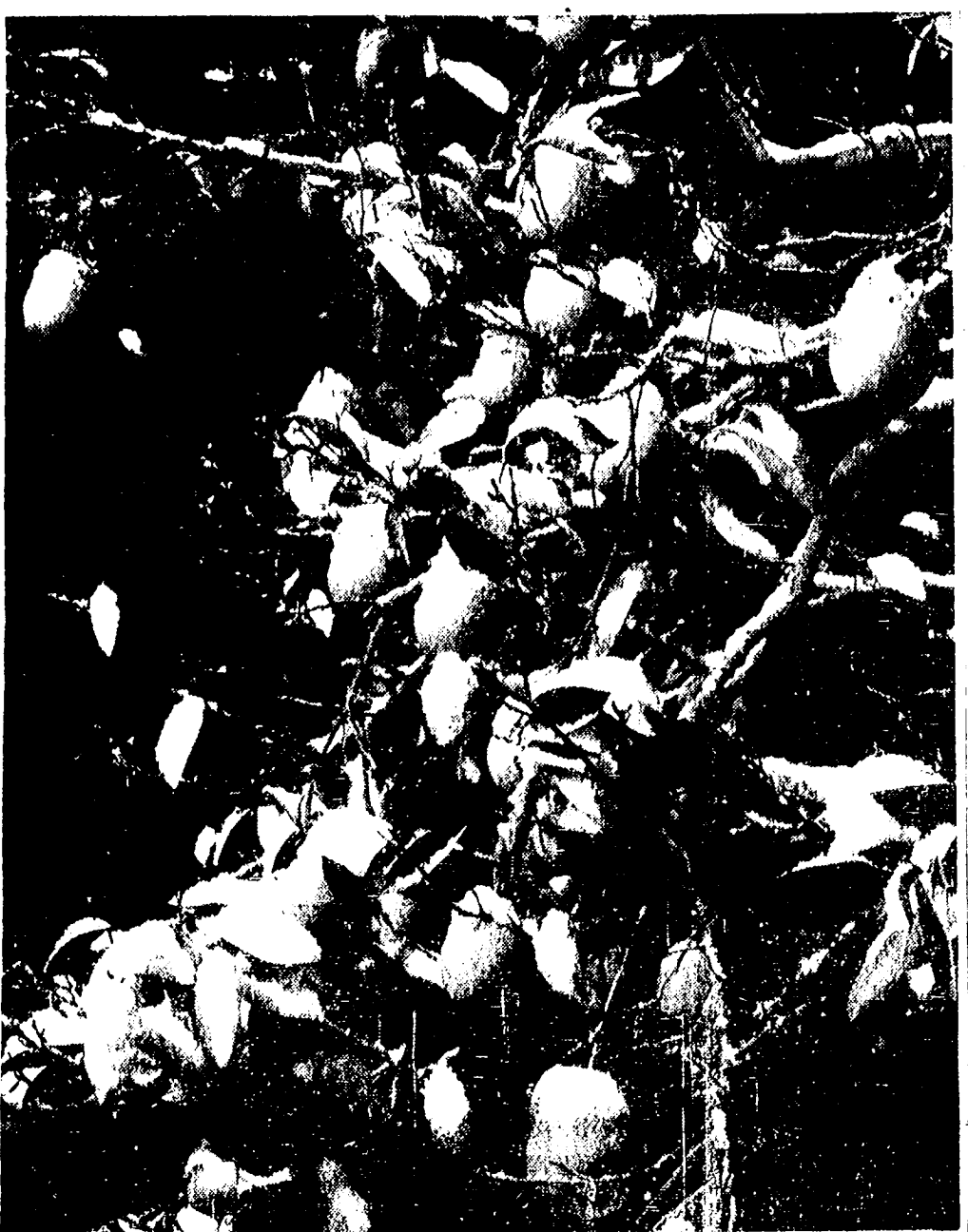
FROSTED ORANGES — Snow decorates these oranges in a tree on Alta Canada Road, La Canada. Nearly two inches of snow blanketed the ground in that area last night.