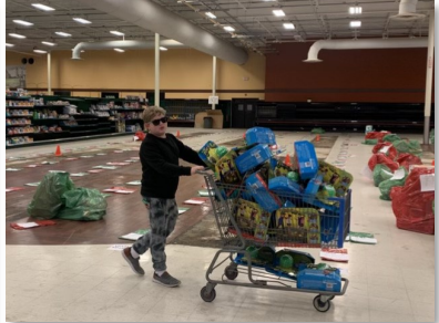
The Joy Fund Foundation Board was joyful!