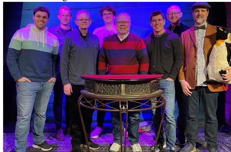
We are at the Penguin Magic Studios

each with hundreds of tricks. I spent hours the whole weekend in that room asking to see demos and losing a lot of my money to some of the coolest tricks ever. After a while in the dealer's room, it was time for the first lecture to start. I wasn't totally sure what to expect from it, but it was better than anything I could ever ask for. In just a short hour I had already learned so much. From that lecture on, I had to take notes to contain the sheer amount of useful information that these renowned magicians offered to us. The next 2 days went by in a split second. It was just a cycle of seeing incredible lectures and performances, buying tricks in the dealer's room, and jamming with other magicians in the common area. Overall, I am very glad I chose to go. Not only did I get to do all the things I mentioned above, but I got to hang out with the Omaha club, and go to cool places around Cleveland, like the Penguin Magic Shop. As a beginner, the environment was so positive and inviting, and I would highly recommend a Magifest trip to anyone even considering it.