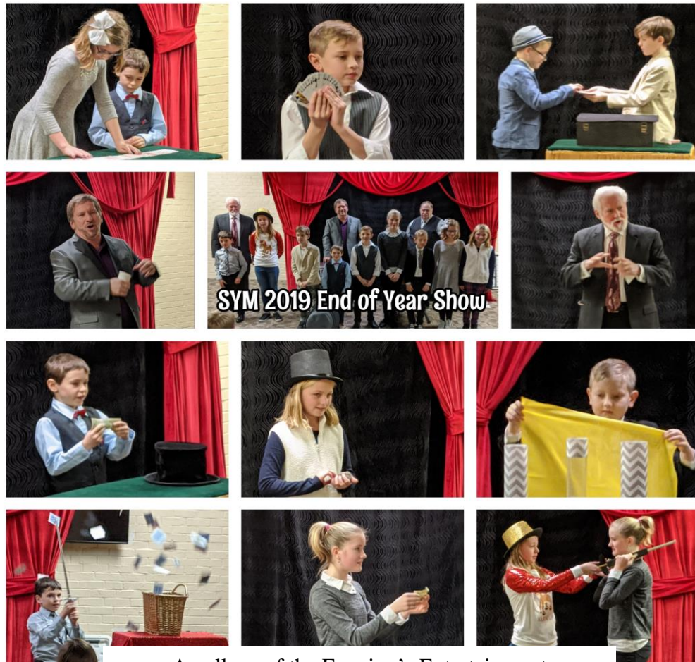
A collage of the Evening's Entertainment