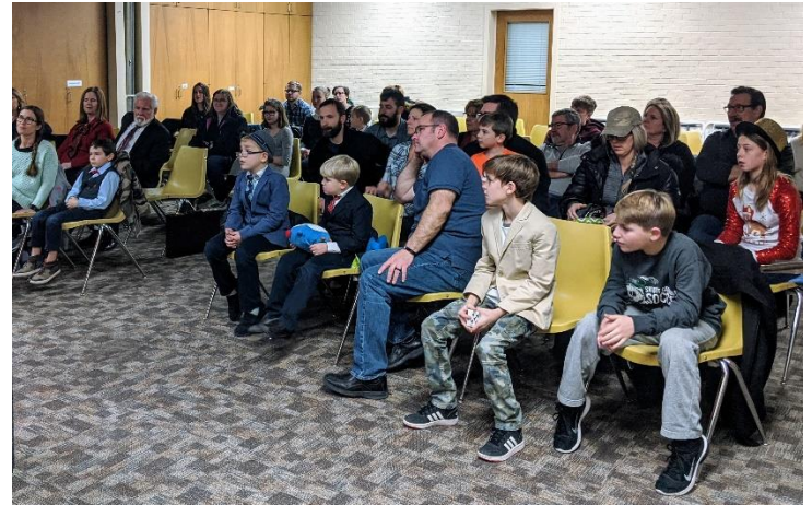
A Spellbound Audience

amazement for parents, friends, relatives and some of our members at large. We look forward to seeing the wonderful things they will develop and perform in the coming years.