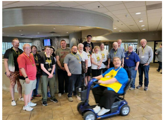
Some of the OMS members at AbraCorndabra

You might wonder if you can acquire any new magic during AbraCorndabra. During the convention there is always a great dealer room! There were many dealers who had many types of magic effects, one with some larger illusions, dealers with books, a new magic toy and some interesting wood effects. On Saturday there is also a silent auction with many items and all proceeds go into the Young Magician's Fund for future scholarships. Before the convention even officially opens, there is a magic flea market. I have never seen so many magicians selling things from their collections!