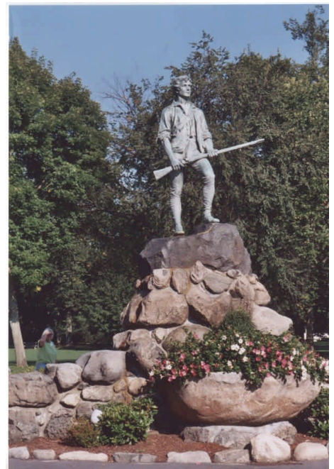
The Minuteman Statue at Lexington, Massachusetts