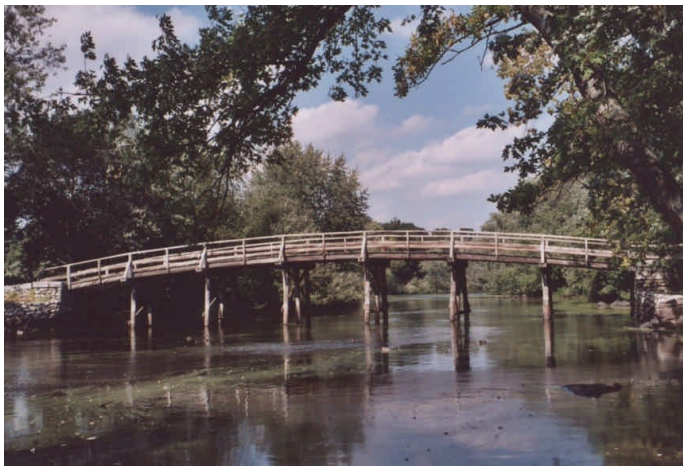
The Old North Bridge Concord, Massachusetts

Although the British fought two small skirmishes at Lexington and Concord, they fought a battle along the road from Concord to Lexington. Some may criticize the tactics used by the patriots in their engagements with the British along the road. However, the tactics they used can be clearly found in any military handbook. When an enemy that has attacked and has turned to retreat, defense forces should pursue the retreating enemy. Not to pursue has been a mistake made, even today, by many military commanders. It is often not done because of troop exhaustion or for humanitarian reasons, but the result is often that the retreating enemy is able to recover and fight another day. There is no doubt that the sting of Lexington and Concord was on the minds of the British during their occupation of Boston. They did not launch any further penetrations into the surrounding countryside.