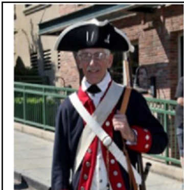
Smiling because his shoes are still clean!