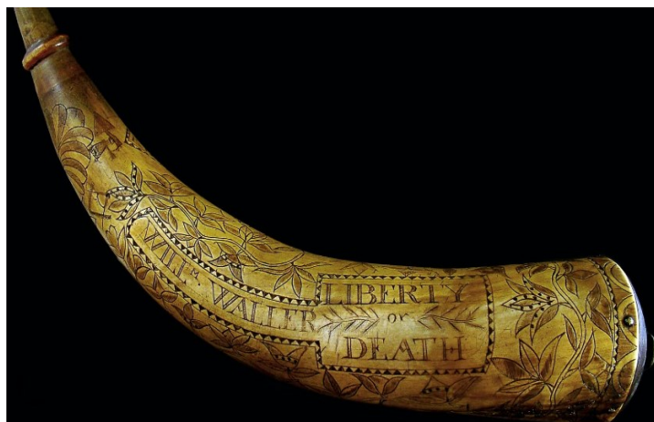
William Waller's Powder Horn - Museum of the American Revolution