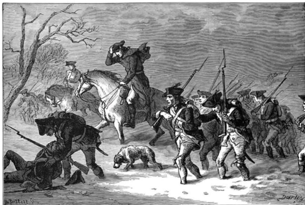
Worn out troops from the northern army under Gates and Sullivan's men faced a grueling winter's march to join Washington.