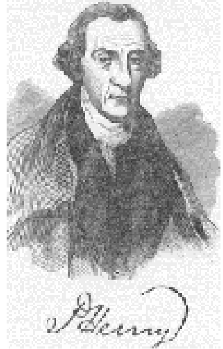
Patrick Henry 1736 - 1799

It is in vain, sir, to extenuate the matter. Gentlemen may cry, Peace, Peace — but there is no peace. The war is actually begun! The next gale that sweeps from the north will bring to our ears the clash of resounding arms! Our brethren are already in the field! Why stand we here idle? What is it that gentlemen wish? What would they have? Is life so dear, or peace so sweet, as to be purchased at the price of chains and slavery? Forbid it, Almighty God! I know not what course others may take; but as for me, give me liberty or give me death! "