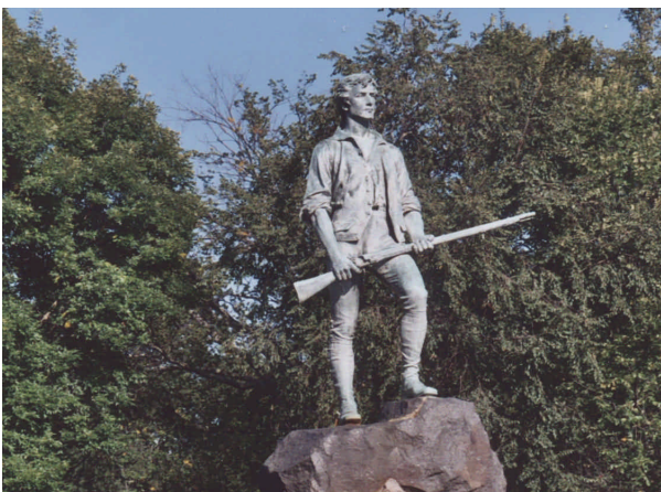
Minuteman on the Lexington Green.