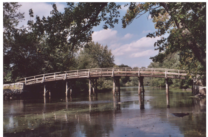
North Bridge at Concord, MA.