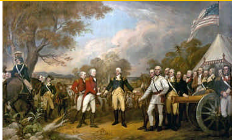
Burgoyne’s surrender at Saratoga

The Battles of Saratoga (September 19 and October 7, 1777) marked the climax of the Saratoga campaign giving a decisive victory to the Americans over the British in the American Revolutionary War. British General John Burgoyne led a large invasion army up the Champlain Valley from Canada, hoping to meet a similar force marching northward from New York City; the southern force never arrived, and Burgoyne was surrounded by American forces in upstate New York. Burgoyne fought two small battles to break out. They took place eighteen days apart on the same ground, 9 miles south of Saratoga, New York. They both failed. Trapped by superior American forces, with no relief in sight, Burgoyne surrendered his entire army on October 17. His surrender, says historian Edmund Morgan, “was a great turning point of the war”, because it won for Americans the foreign assistance which was the last element needed for victory.