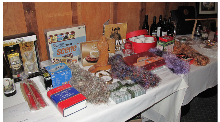
A table full of raffle gifts. Thank you to everyone who brought a raffle gift.