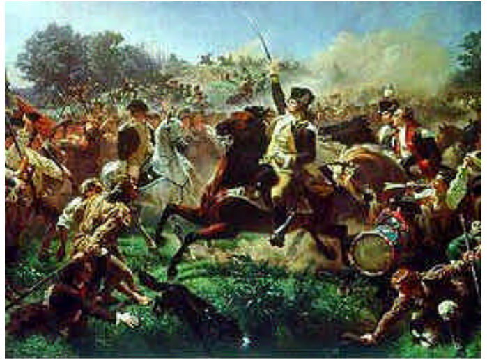
Washington Rallying the Troops at Monmouth by Emanuel Gottlieb Leutze