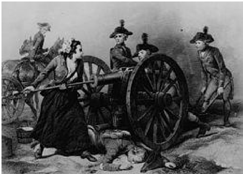
The legend of Molly Pitcher is closely associated with the battle