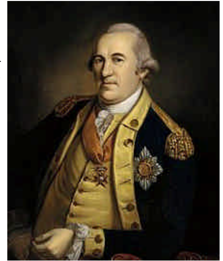
Baron Von Steuben

In 1777, Count St. Germain, French Minister of War, persuaded a professional soldier, Count Von Steuben, to come to America to help Washington build an army which could stand up to the British army in open combat. He volunteered to serve the American army, asking only to be accepted on his own experience and merit to improve the quality of the army. He was approved and recommended to Congress by Benjamin Franklin as an excellent teacher of Prussian military tactics, an outstanding recommendation as Prussia was noted for its military excellence.